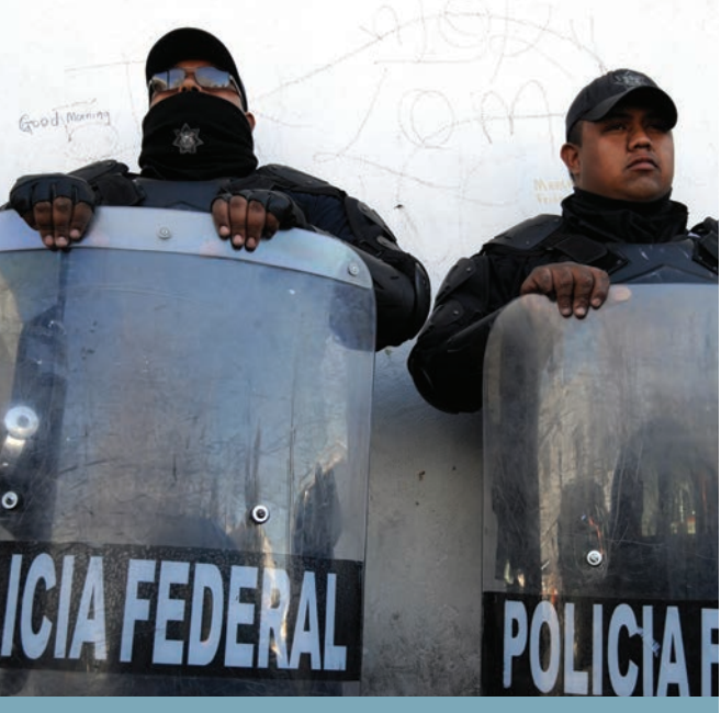
Mexico's drug war: more than 36 000 deaths since 2006

"Mexico's police and armed services are known to be contaminated by multimillion dollar bribes from the transnational narco-trafficking business. Though the problem is not as pervasive in the military as it is in the police, it is widely considered to have attained the status of a national security threat." Transparency International <sup>(2)</sup>