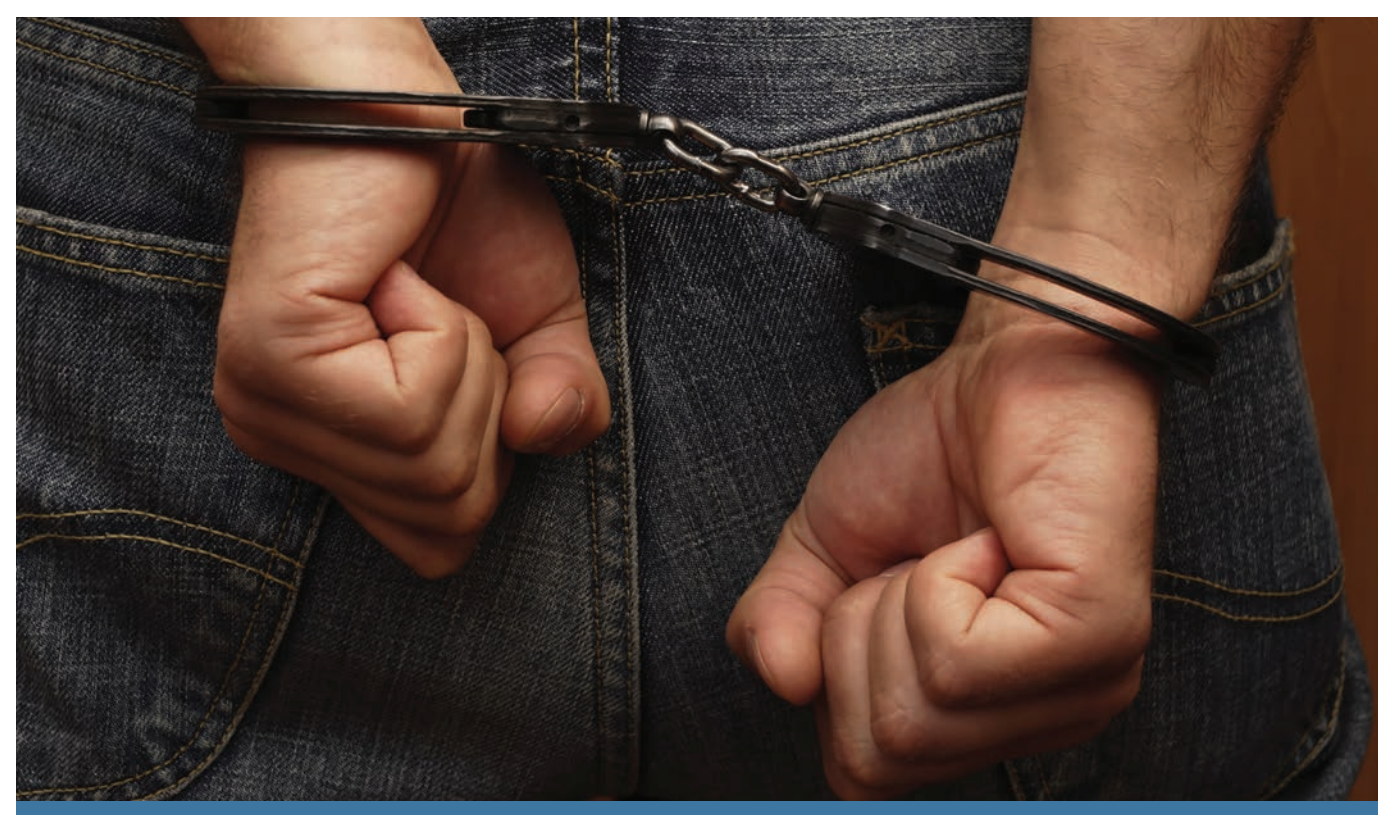
The war on drugs has led to widespread human rights abuses and mass criminalisation of vulnerable populations

These benefits are hugely outweighed by the devastating social and economic costs of the drug war, but any change in drug control policy should consider the development impacts – particularly for the majority of individuals involved in the illicit economy, who do not fit the stereotype of the billionaire drug barons. <sup>(14)</sup>