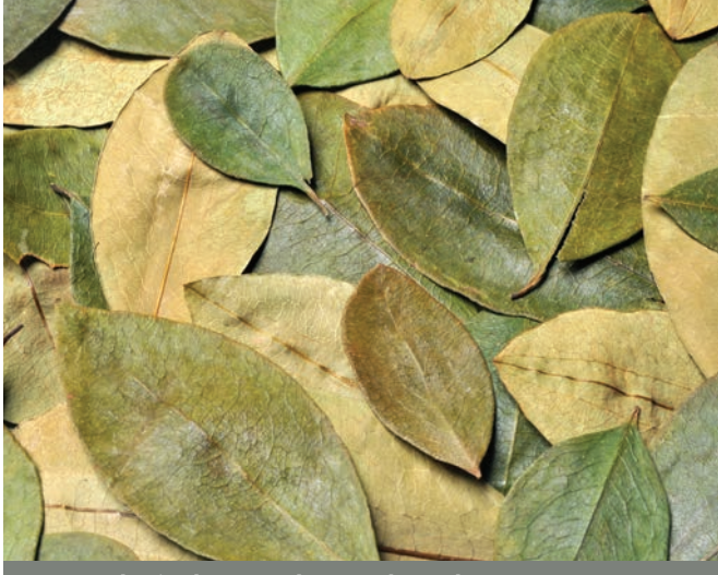
Coca production has more than met demand, despite decades of crop eradication