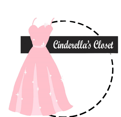
Turning Dresses into Dreams...

Drama Club Fundraiser See your email to sign up for a time to shop in the library!