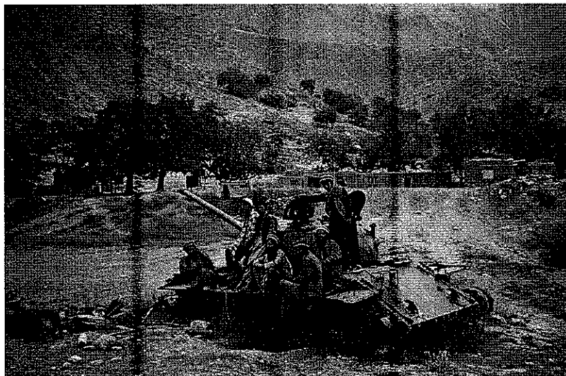
Mujahideen sitting on top of a destroyed Soviet tank, September 1988.

The Soviet military actions were tremendously destructive. The war took a terrible toll in Afghan lives. In addition, it altered the structure of Afghan society. To clear the rural areas of mujahideen guerrilla soldiers, the Soviets used violence to terrorize the Afghan people and force them out of the countryside to the cities; the population of Kabul tripled. With farmers driven from the countryside, Af-