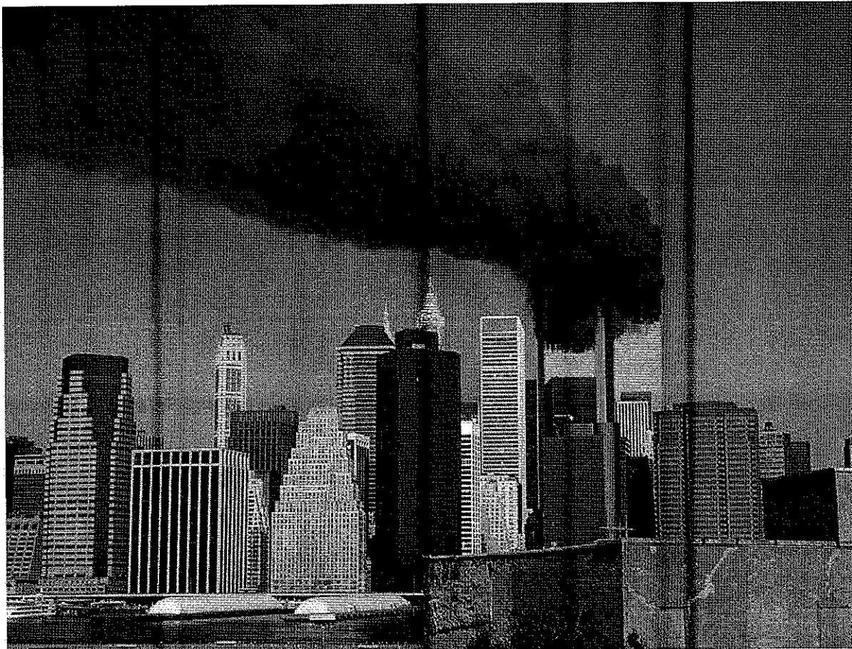
The World Trade Center buildings, September 11, 2001.

“There will be a significant terrorist attack in the next weeks or months.... Multiple and simultaneous attacks are possible and they will occur with